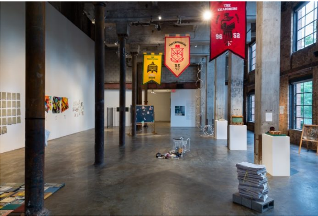
“Race and Revolution: Still Separate – Still Unequal” at Smack Mellon, installation view.

Upon entering the gallery, three felt flags hang in the middle of the space between large rows of pillars. The flags seem to bear school names and colors but pay close attention to the writing and pictures featured; they represent systems that mean to control students. Each flag was entitled, by the artist Olalekan Jeyifous, as The Panopticons , The Examiners , and The Enforcers , respectively. Each flag features corresponding depictions all representing the controlled and standardized nature of American public education that to seems to seek enslavement, not freedom as it totes.