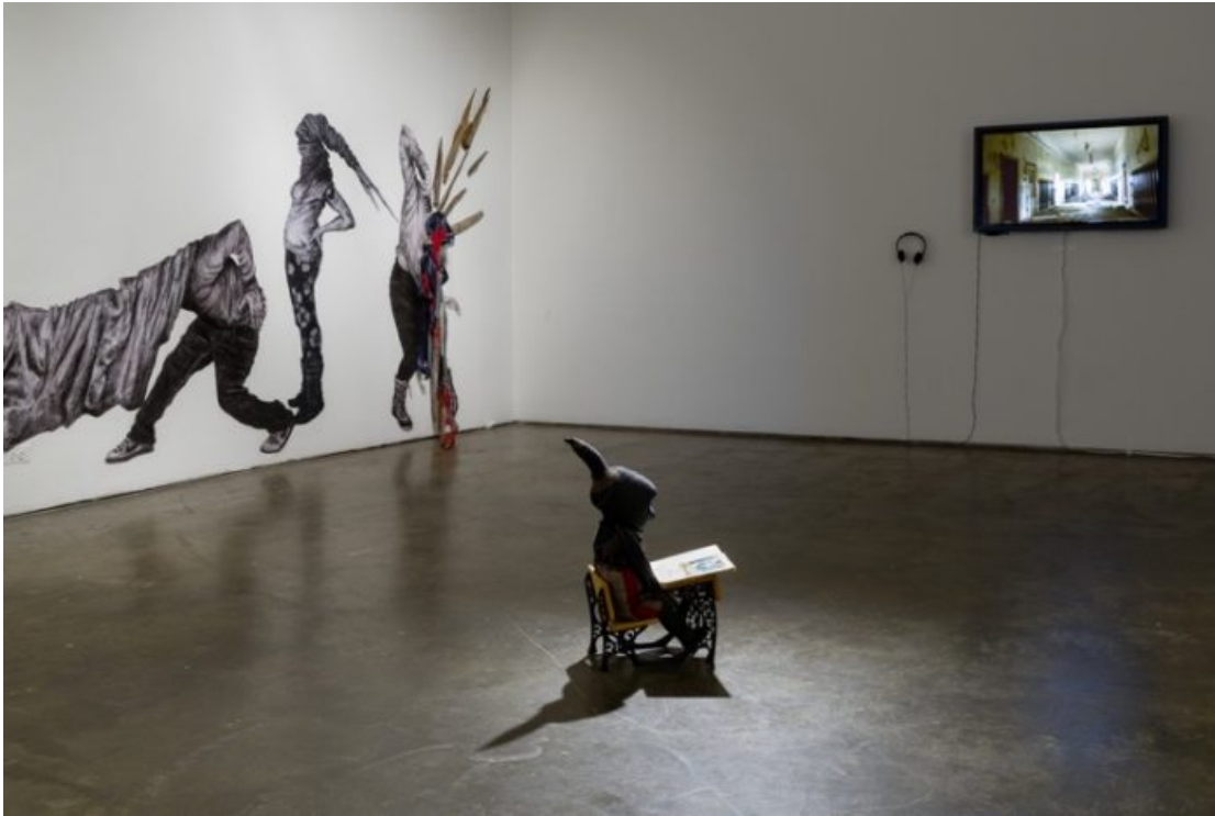
“Race and Revolution: Still Separate – Still Unequal” at Smack Mellon, installation view.

The incipience of Black Lives Matter, a reactionary movement to police violence against people of color, in combination with sobering results of the recent Presidential election, marked a time of resurfacing conversation surrounding issues of race (also gender and sexuality).