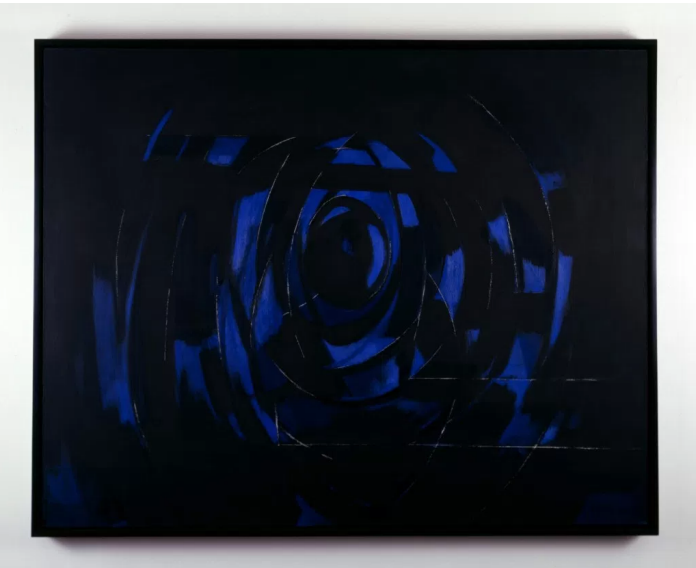
NORMAN LEWIS, "Blue and Boogie," 1974 (oil on canvas). | The Studio Museum in Harlem; gift of Estate of Norman Lewis 1981.1.1