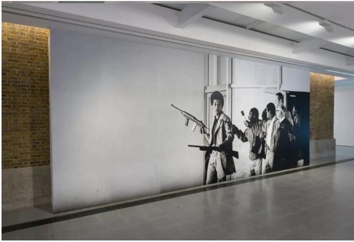
Installation view, ARTHUR Jafa, "A Series of Utterly Improbable, Yet Extraordinary Renditions," Serpentine Sackler Gallery, London, 2017.