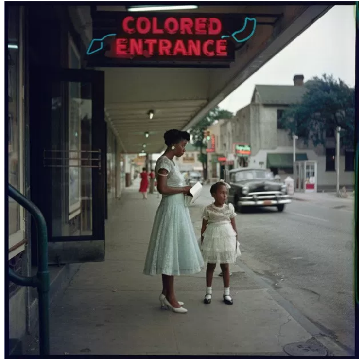
GORDON PARKS, “Department Store, Mobile, Alabama,” 1956.