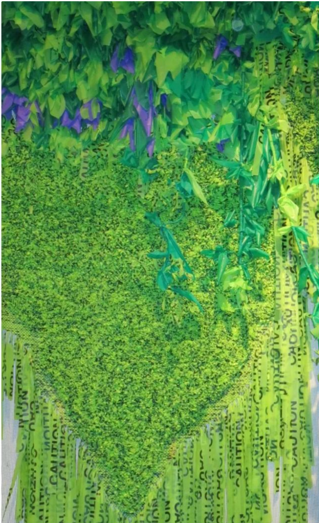
Green Unplugged (Expanded), Borinquen Gallo, 2017, Debris netting, plastic bags, caution tape and URL cables

I like how Borinquen Gallo transforms recycled garbage bags and "caution" tape into an intriguing tapestry, Green Unplugged , exploring themes of environmental degradation, excessive consumption and climate change denial.