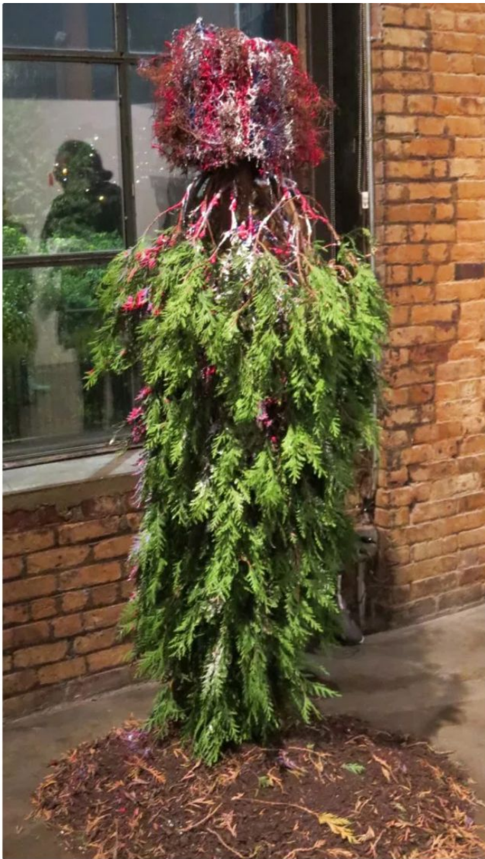
Veritas Inverso, Cecile Chong, 2017, Encaustic and Western Arborvitae

Cecile Chong took the title of the show literally, and, after much effort, found a young tree with a root ball, which she then inverted and coated with encaustic paint (wax and resin) in the colors of the U.S. flag, to demonstrate how people are feeling today.