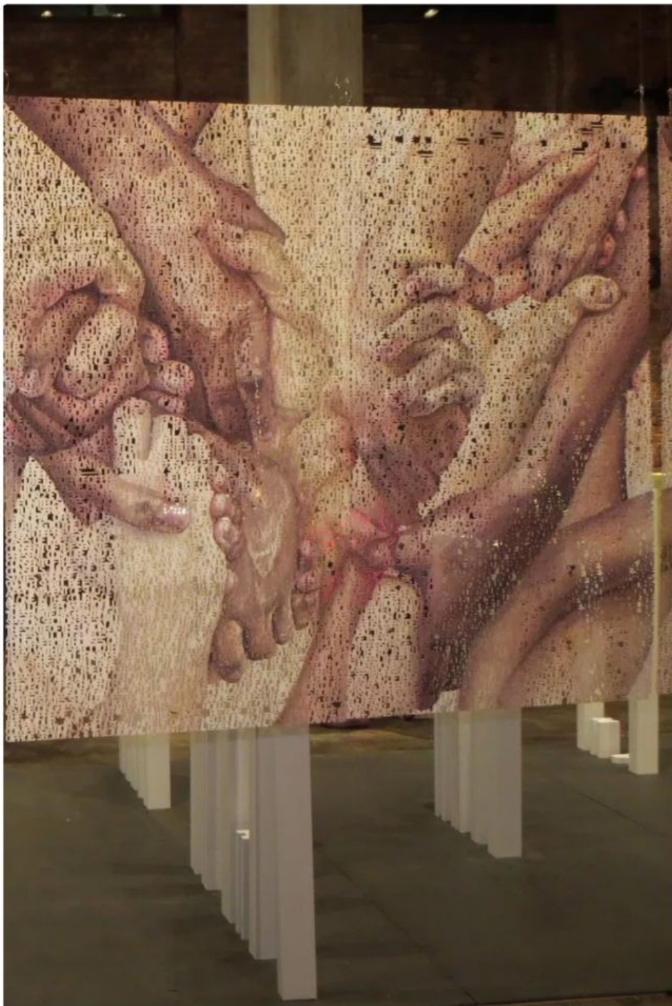
America's Social Contract, Diana Schmertz, 2017, Watercolor on laser cut paper

America's Social Contract by Diana Schmertz is a bit over 2' high and 14' long. Each of the 7 panels is painted with a watercolor image of two or more hands of diverse races reaching and pulling each other up. When you get closer, you'll notice that the paper on which the image has been painted, has been cut out with the text of the U.S. Constitution!