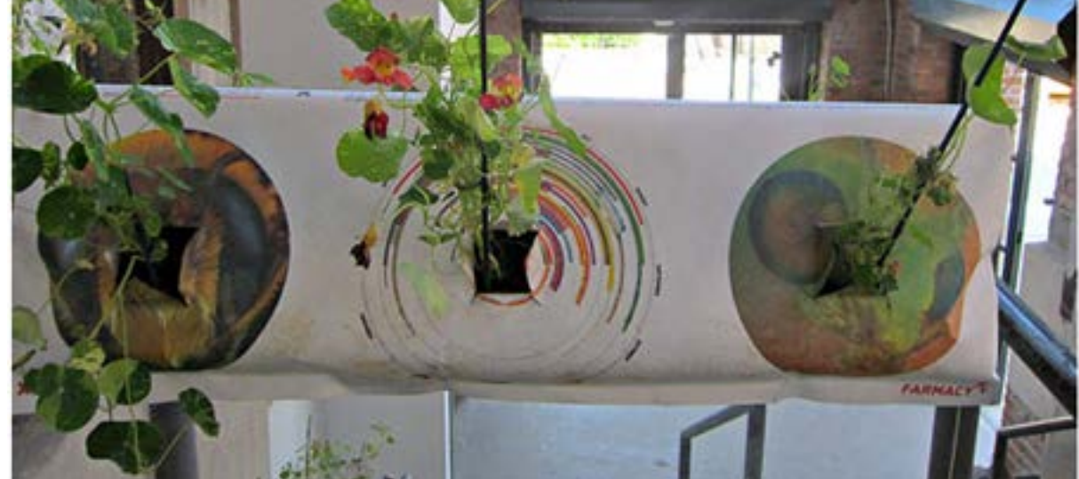
Natalie Jeremijenko's "AgBogs" growing in the gallery

FOODshed continues at Smack Mellon (92 Plymouth Street, Dumbo, Brooklyn) through July