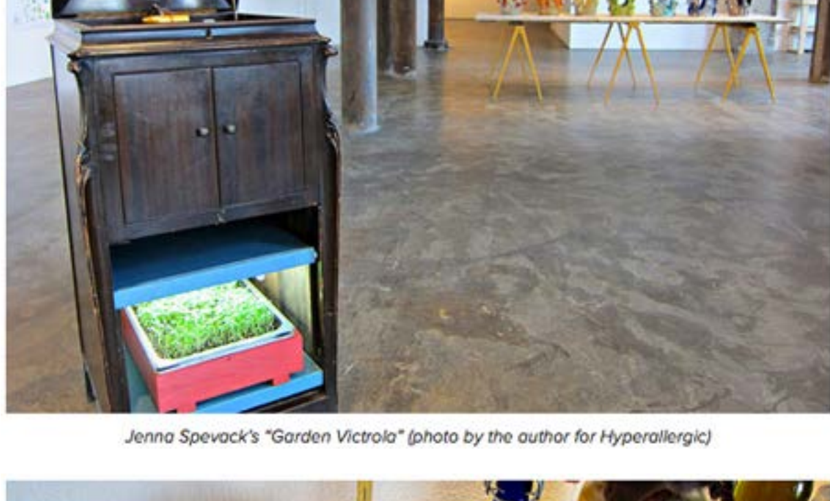
Jenna Spevack's "Garden Victrola"

farmland anytime soon. Another of the neighborhood projects is from Brooklyn-based artist team Kristyna and Marek Milde. Called À la cart , the artists corralled some shopping carts into vegetable gardens at Old Fulton Street, and in Smack Mellon are coordinating food workshops focused on what can be grown collectively on the city streets.