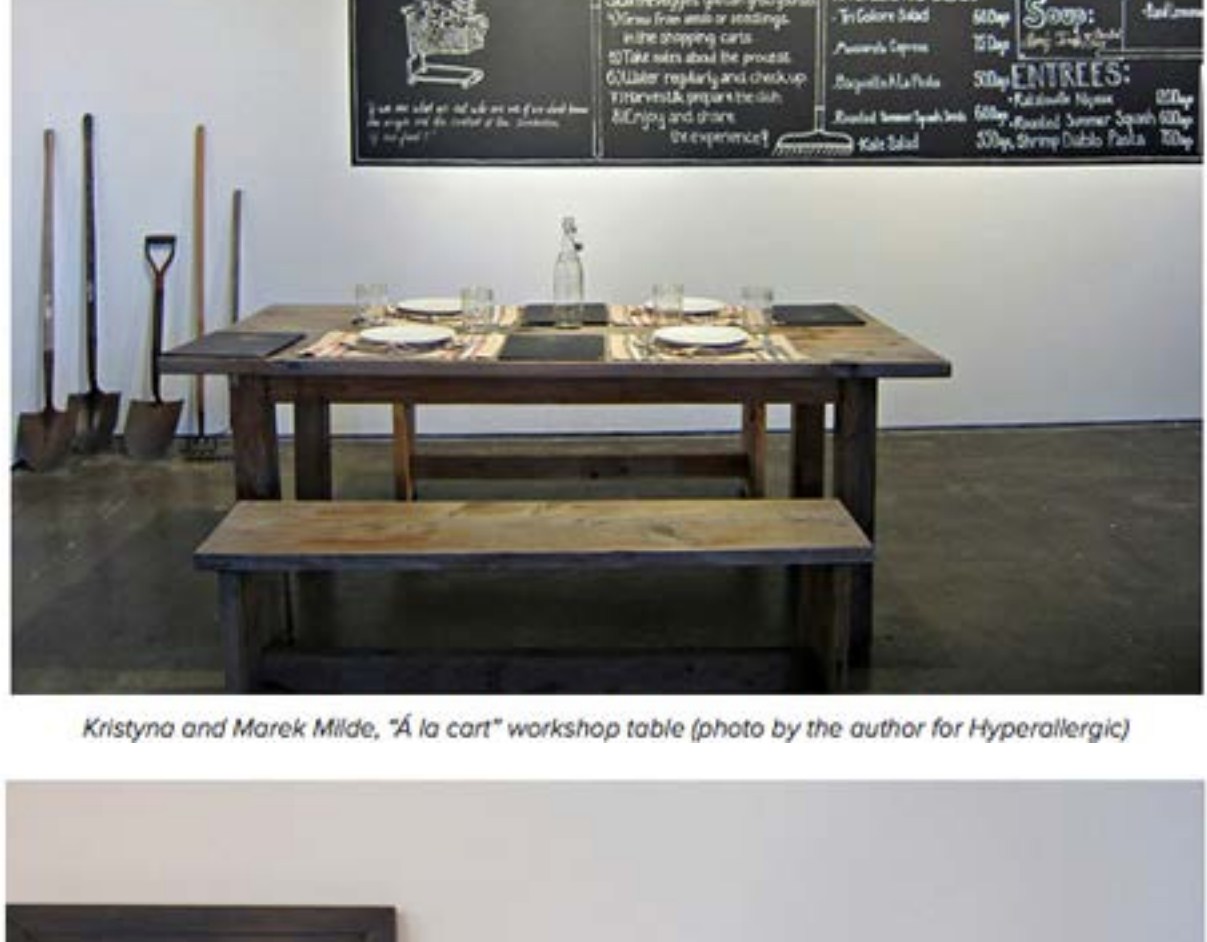
Kristyna and Marek Milde, "À la cart" workshop table