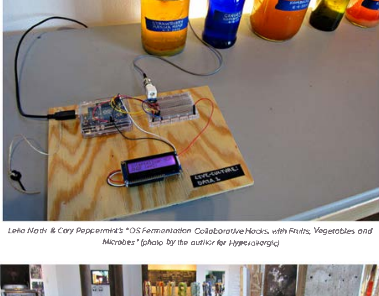
Leila Nadir & Cory Peppermint's "OS Fermentation Collaborative Hacks, with Fruits, Vegetables and Microbes"