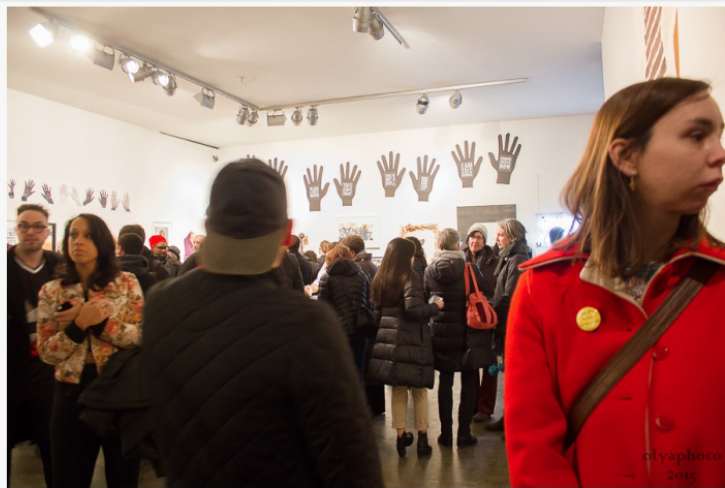
The Art goers come out for RESPOND at Smack Mellon

The line wrapped around the brick face corner facade of the non profit gallery Smack Mellon in DUMBO last night. The expansive 5000 square foot space exhibited juried work, after an open call for submissions for work that responds to the recent killings of unarmed black men by police officers and the protests that ensued. The work exhibited salon style with banners running across the ceilings and depictions of hands running across the walls displaying slogans of the movement, expounding on – let us breathe and black lives matter , created a space that was filled with wonderment, sadness and the resolute feeling that something needs to change.