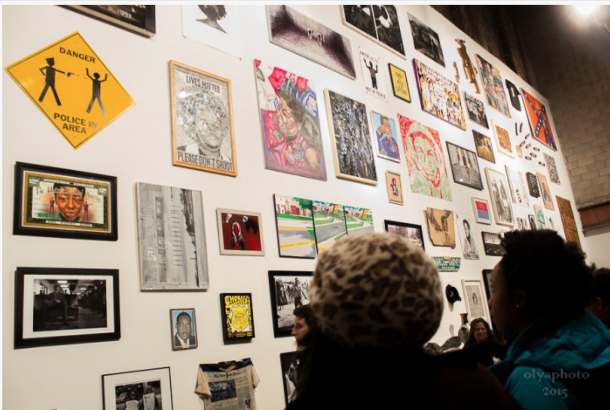
So many statements made at the show RESPOND in Smack Mellon