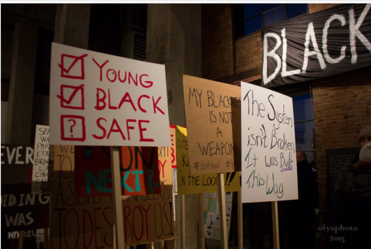
Respond at Smack Mellon in DUMBO