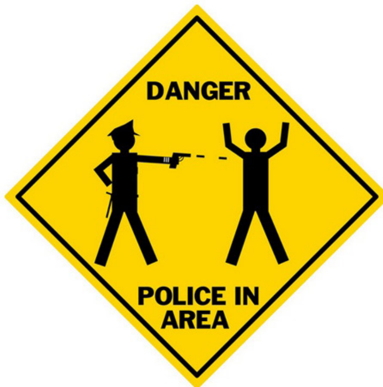
Dread Scott, Sign of the Times , 2001

Pop cultural representations are often just memetic iterations with slight alterations. As such, most culture serves a single purpose: to reinforce the social relationships and ontologies existing in that moment. Culture is often still unidirectional—that is, it moves vertically from the top down—despite the burgeoning flatness—the horizontality—of production online. The reality of Black Twitter goes to show just how necessary a popular culture grounded in the experience of blackness is, along with its ability to be given flight by horizontal networks of communication. Because of this flatness of production, cultural ruptures will be more frequent and more widespread. The unidirectionality of popular culture will be challenged more and more as it becomes more multidirectional and the hegemonic voices of the few become drowned out by the establishment of the many. RESPOND begins to do just that.