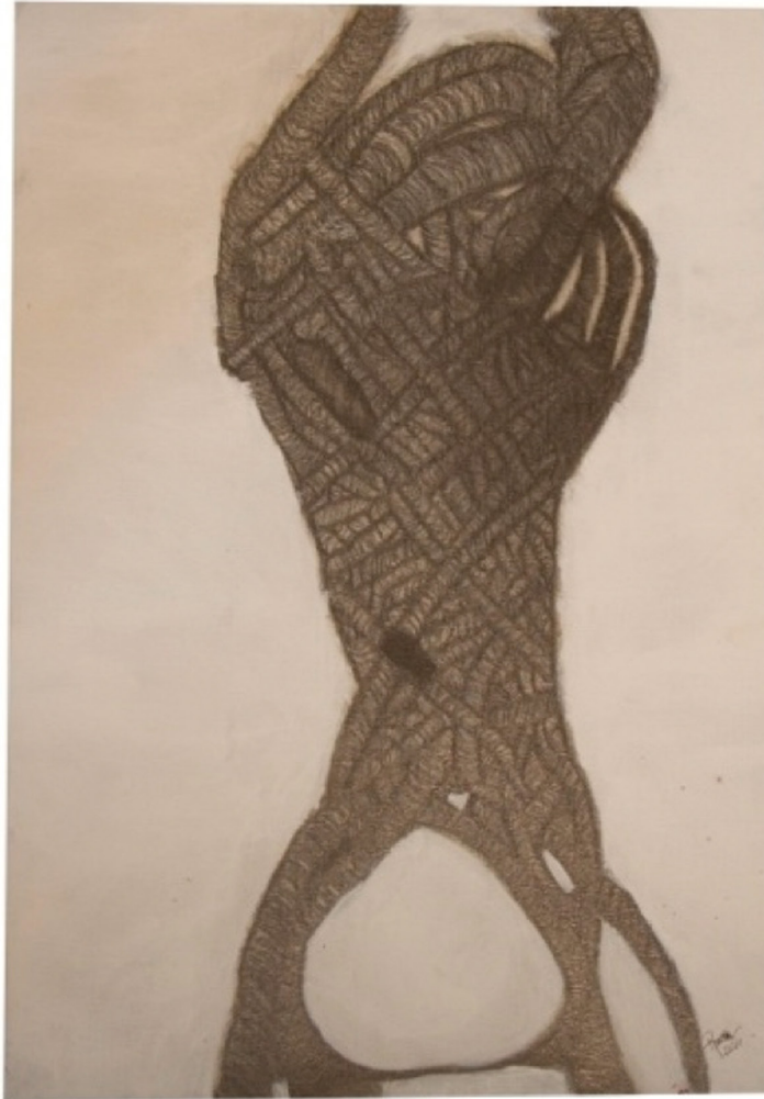
📷 Strange Fruit.