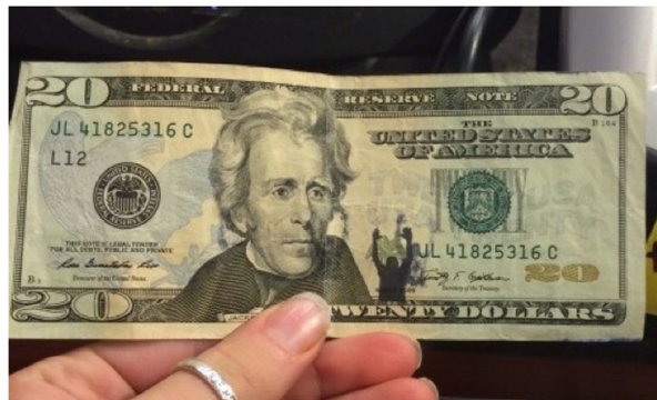
Hands Up Don't Shoot.

De Lappe: "I was touched by the situation in Ferguson , and in New York. A bunch of my work deals with violence, more often military violence. I had created a rubber stamp this fall of a drone . I saw the bills have this empty sky and I always have drones on the brain. So I have 700 of those stamps in circulation.