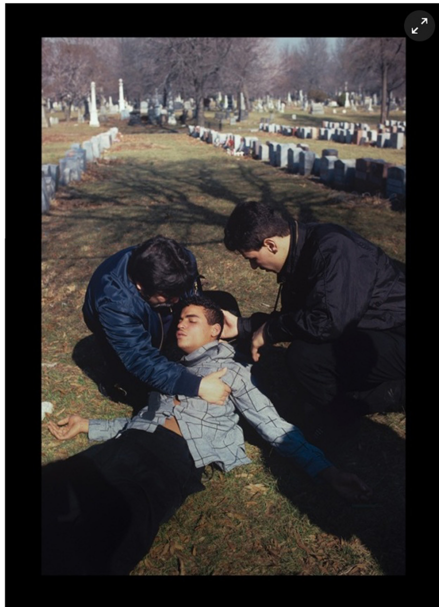
📷 Nina Berman: ‘for the families, it will remain as a shock and a loss.’