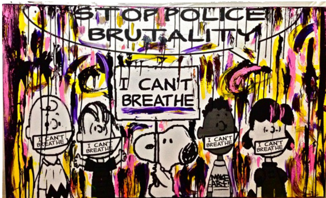
Savior Elmundo: Peanuts Gang - Can't Breathe, 2014 Acrylic, enamel, and spray paint 36" x 60" x 1 1/2"

Artists in the show range from those having their work shown in an exhibit for the first time and those who don't consider themselves professional artists—to more well-known names like Dread Scott, whose work has been exhibited at the Whitney Museum of American Art and the Brooklyn Academy of Music, Mel Chin who has shown at the Museum of Modern Art, and Heather Hart whose work is currently on display at the Brooklyn Museum.