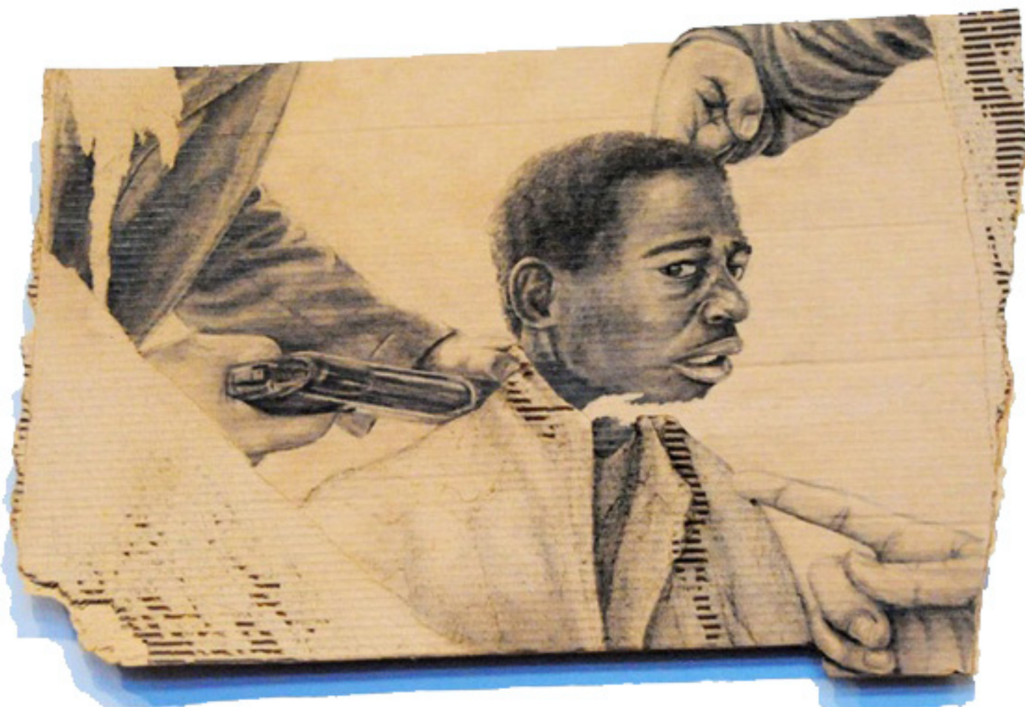
Dareece Walker: Criminalized Charcoal on Corrugated cardboard 24" x 18"

by Li Onesto | February 2, 2015 | Revolution Newspaper | revcom.us