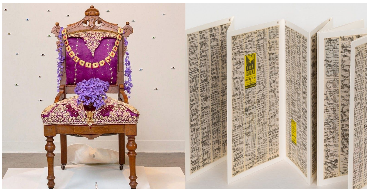
Image left: Esperanza Cortés, Charlotte (detail), 2019, installation with chair, found embroidery, glass beads, metal, chain, ceramic, pigment, faux pearls, plaster on wire mesh, 9' x 15' x 9'. Courtesy of the artist. Image right: Viviane Rombaldi Seppey, Along the Lines (detail), 2016, phonebook pages, ink, paper, 14 1/8" x 6 3/4" x 2" (closed book). Courtesy of the artist. Photo: Etienne Frossard.

Media contact Jessica Holburn: jholburn@smackmellon.org