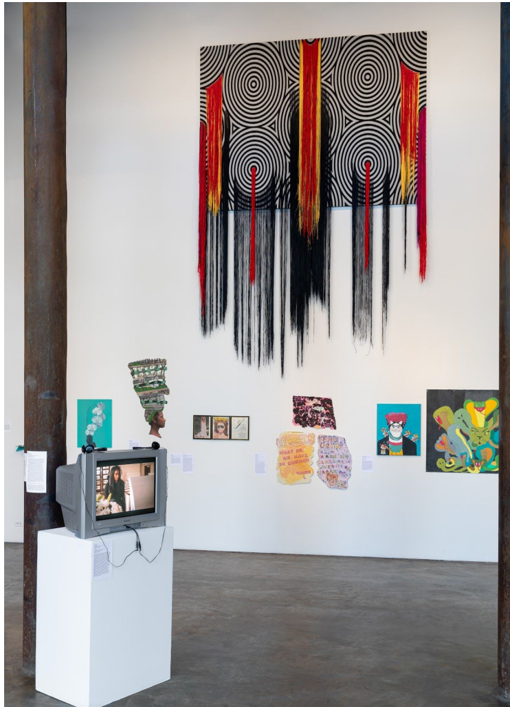
Installation view of Idol Worship , curated by Emily Colucci.

As 2019 soon comes to a close, what are some takeaways that you'd like to share with other female artists, or to share generally? I ask since the art world is hectic, and can be so overwhelming (with everyone trying to figure out how they do or don't fit into it). You are both two very talented ladies who curate, write, and make art.