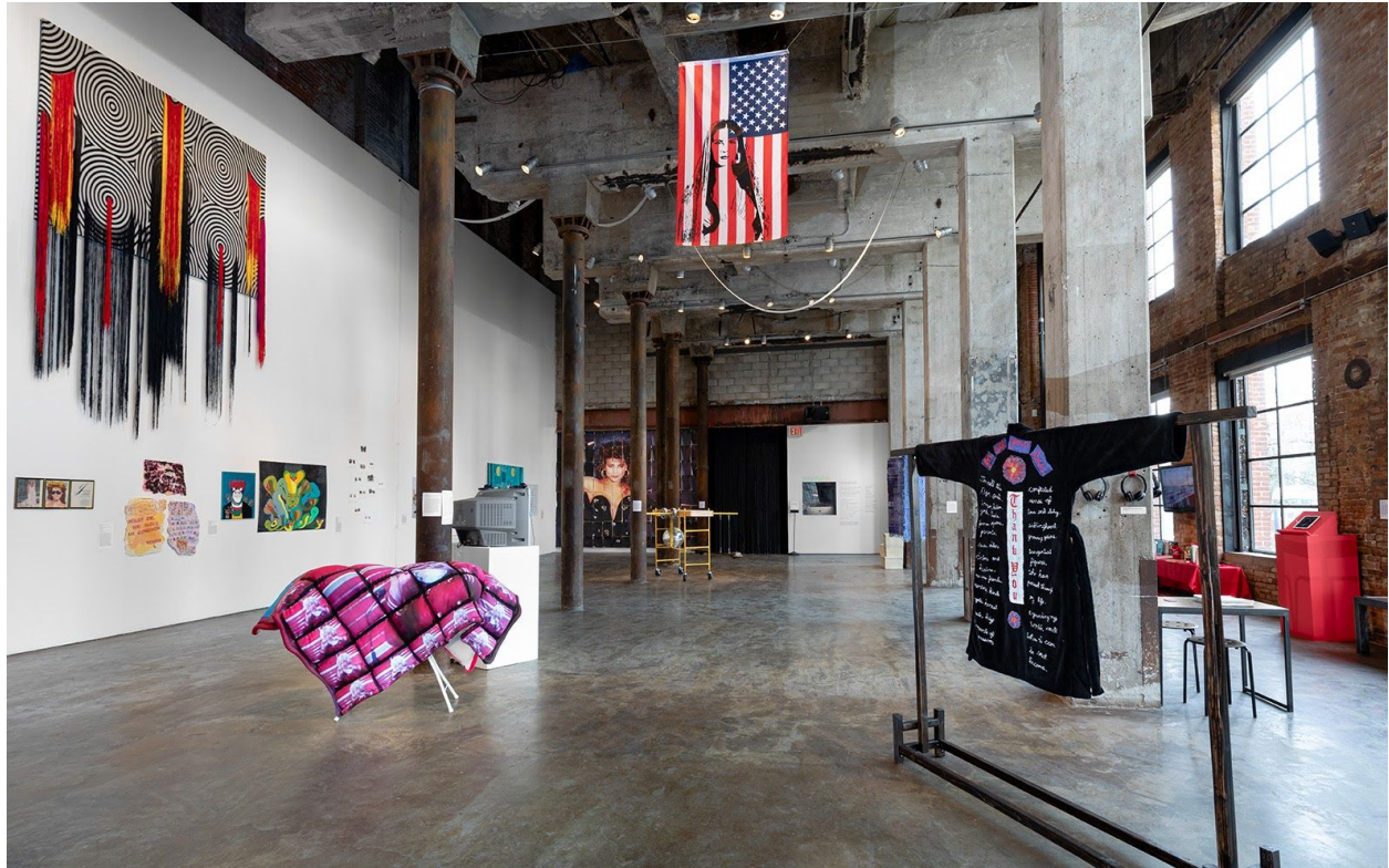
Idol Worship , curated by Emily Colucci, installation view.

So, you are exposing them as colloquially equivalent? You want to create (or sustain) a shared language around women idols regardless of their role in society/culture/politics?