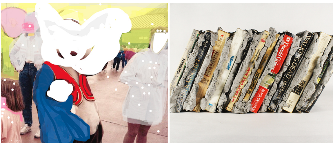
Left: Katya Grokhovsky, Postcards from America , 2020, digital painting and collage. Courtesy of the artist. Right: jc lenochan, Get smart again , 2021, mixed media, 6" x 14" x 5". Courtesy of the artist.

Media contact Audrey Irving: airving@smackmellon.org