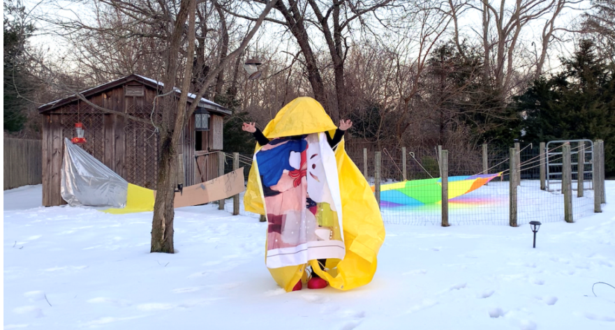
Image: Katya Grokhovsky, Becoming American , 2020, video still.

Activating the site of her FANTASYLAND installation, Katya Grokhovsky will give a live performance of Becoming American , which explores the place, memory, alienation, and displacement of an immigrant protagonist. The 40-minute performance