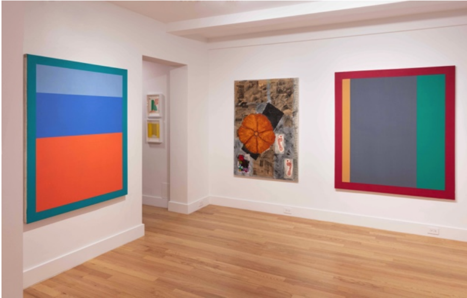
Installation view, Freddy Rodríguez: Early Paintings 1970–1990 , Hutchinson Modern & Contemporary, 2020–2021

A titan of experimental film, Cauleen Smith has spent decades making moving image works and installations that center collectivity, Black histories, spirituality, and science fiction. Now in its final weeks, Mutualities focuses on two of her recent films, Sojourner (2018) and Pilgrim (2017), as well as a series of her literary drawings.