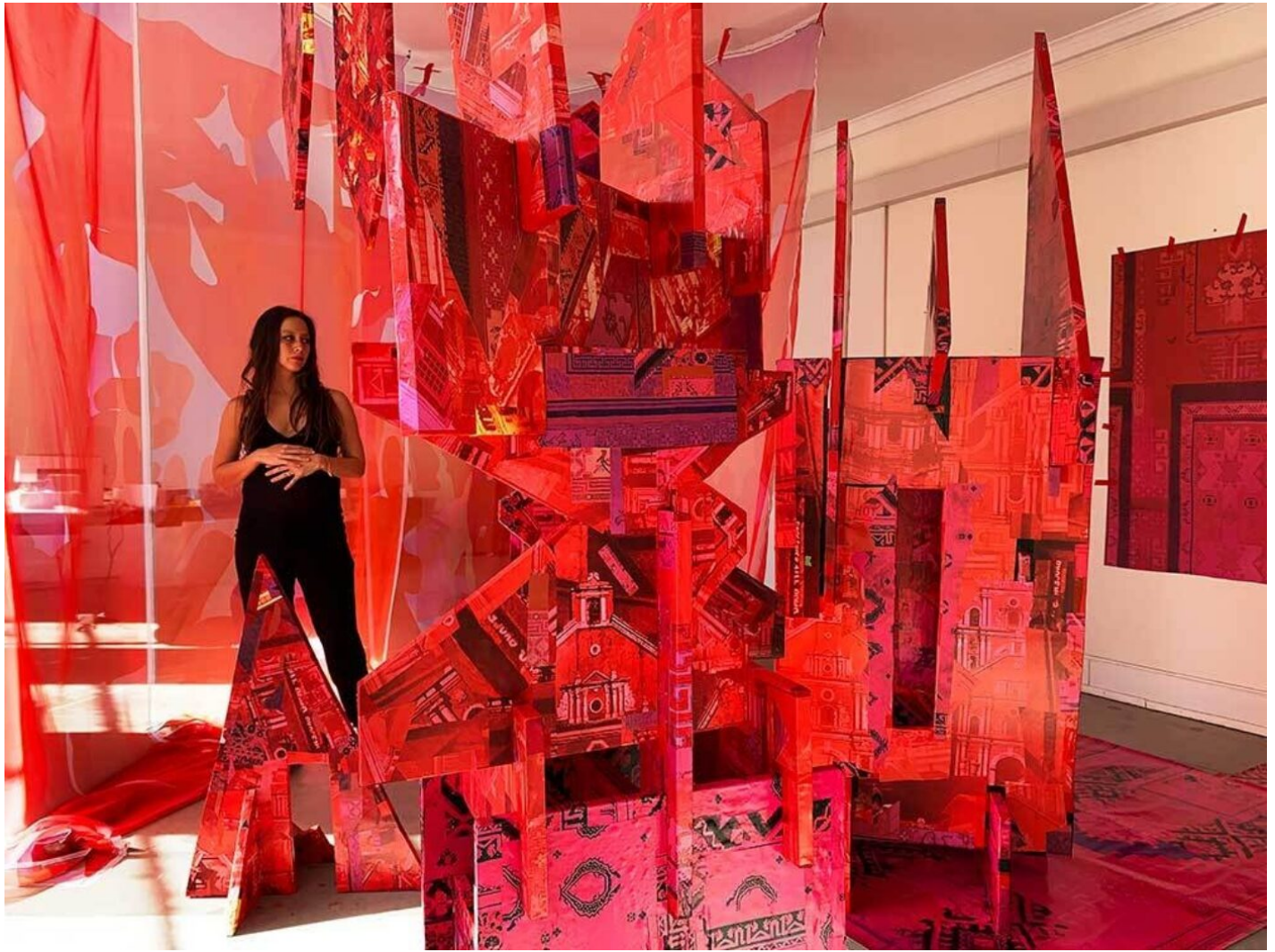
Sara Jimenez, Roots Burrow Through Stones and Hard Facts , 2021, fabric, foam and vinyl sculptures, wallpaper, multi-channel soundscape, 26 × 24 × 12 feet (image of work in progress).