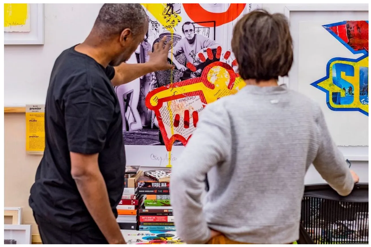
DUMBO Open Studios is returning April 23 and 24.

More than a hundred artists working out of studios in DUMBO will open their doors to the public for the weekend as part of the annual DUMBO Open Studios .