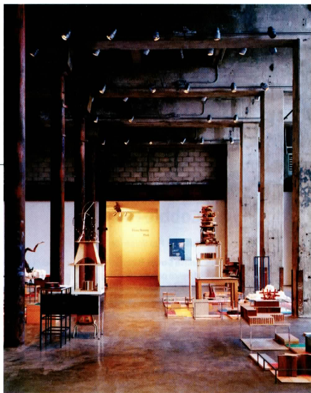
Left: Smack Mellon Gallery, located in a former 1910s boiler-house Below: Empire-Fulton Ferry State Park, where water meets the green in Dumbo

ist studios and 200 residential rental properties and has leased out more than 500,000 square feet of office space since 1980. At least 30 galleries, including Smack Mellon, located in a spacious 1910-era former boiler-house, now make their home in Dumbo. "To me, it's the